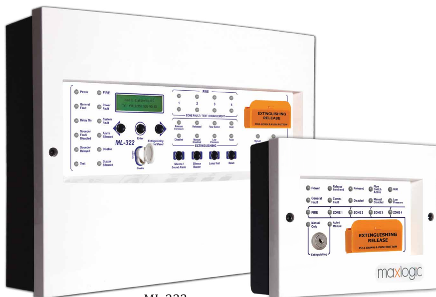
ML-322 Fire extinguishing control panel

Conventional series fire extinguishing control panel operates on cross-zone principle, has 4 detection zones and one extinguishing release output which is programmable according to the zone requirements. Conventional extinguishing control panel is microprocessor controlled, offers high performance and can easily be integrated into all extinguishing projects.