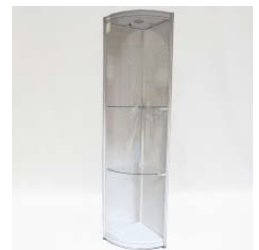
Showcase rounded can be ordered on form T4.4