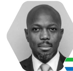
Hon. Jiwoh E. Abdulai Minister of Environment and Climate Change Sierra Leone