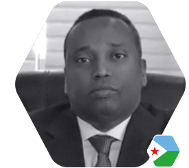
Hon. Yonis Ali Guedi Minister of Energy and Natural Resources Republic of Djibouti