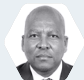
Hon. Lefoko Moagi Minister of Minerals and Energy Botswana