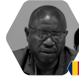
Hon. Thierry Kamach Minister of Environment and Sustainable Development Republic of Chad