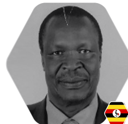
Hon. Sam Cheptoris Minister of Water and Environment Republic of Uganda