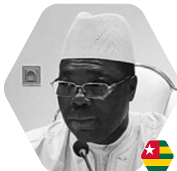
Hon. Katari Foli-Bazi Minister of the Environment Republic of Togo