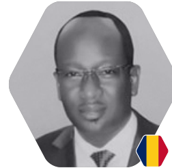
Hon. Abdelkerim Mahamat Abdelkerim Minister of Mines and Geology Republic of Chad