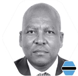
Hon. Lefoko Moagi Minister of Minerals and Energy Republic of Botswana