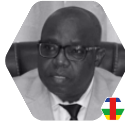
Hon. Arthur Bertrand Piri Ministre du Developpement de l'Energie et des Ressources Central African Republic