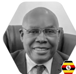
Hon. Okassai Opolot Minister of State for Energy, Ministry of Energy and Mineral Development Republic of Uganda