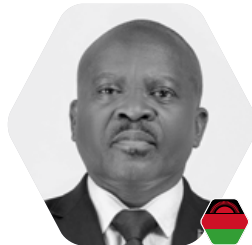
Hon. Dr. Michael Usi Minister of Natural Resources and Climate Change Republic of Malawi