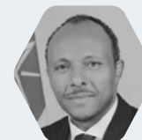
Hon. Dr. Ing. Habtamu Itefa Geleta Minister of Water and Energy Federal Democratic Republic of Ethiopia