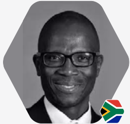
Hon. Masondo Deputy Minister of Finance South Africa