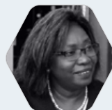
Hon. Aissatou Sophie Gladima Siby Minister of Petroleum & Energy Republic of Senegal