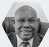
Hon. Okaasai S. Opolot (MP) Minister of State for Energy, Ministry of Energy and Mineral Development Republic of Uganda