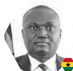
H.E. Charles Owiredu High Commissioner Republic of Ghana