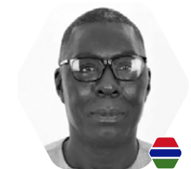
Hon. Abdoulie Jobe Minister of Petroleum and Energy Republic of The Gambia