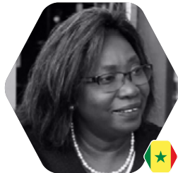
Hon. Aissatou Sophie Gladima Siby Minister of Petroleum & Energy Republic of Senegal