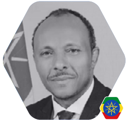
Hon. Dr. Ing. Habtamu Itefa Geleta Minister of Water and Energy Federal Democratic Republic of Ethiopia