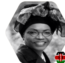
H.E. Catherine Muigai Mwangi High Commissioner Republic of Kenya