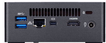
Ultra compact PC - Gigabyte BRIX