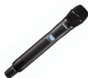
Wireless hand-held microphone