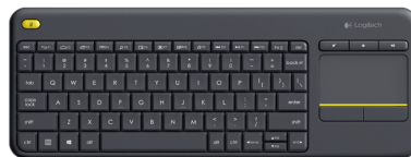
Wireless keyboard - azerty