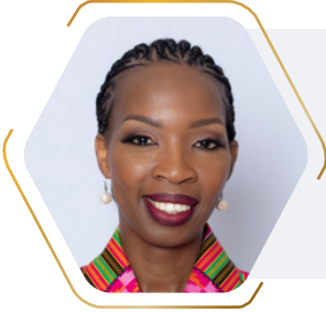
Bertha Dlamini President African Women in Energy and Power